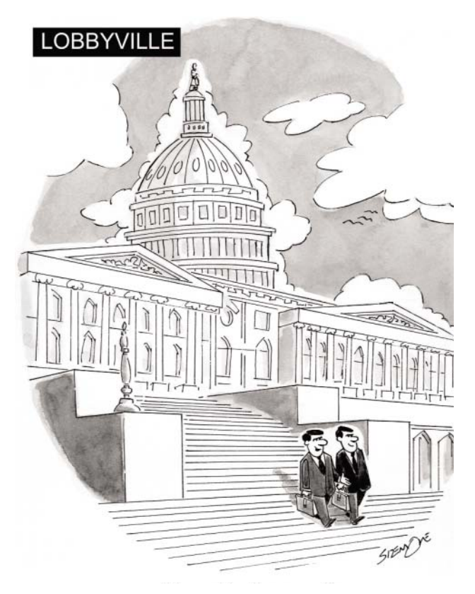
I love this dirty town

in March 2008 following an internal investigation into the receipt of irregular payments. Continuing to mimic American manoeuvres around the negotiating table, the Director followed the civil recovery order route but also linked the unlawful conduct to "books and records" offences rather than their more heavy weight cousins of bribery. The settlement again borrowed from "the American experience" through AMEC agreeing to appoint an independent consultant to review their improved compliance procedures.