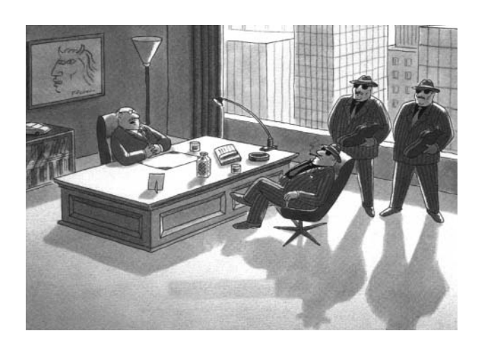
I'm thinking of getting back into crime, Luigi, – legitimate business is too corrupt.

OFFP, the company disclosed to the Office of Foreign Assets Control ("OFAC") violations of the Trading with the Enemy Act in relation to trade with Cuba between 2001 and 2005.